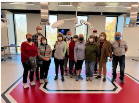
OSURA members were most impressed with the OSU Crane Sports Medicine Complex.

Cost: On your own, order through cafeteria line starting at 11:15 a.m., program at approximately 12 noon.