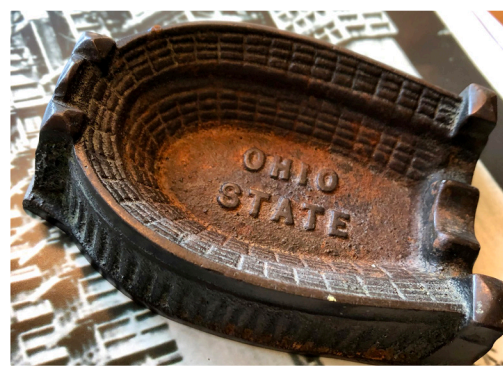
Treasured memorabilia from the stadium fund raising

The Ohio State University Alumni Association has just announced that the OSURA society has just earned Scarlet status and has been named as an Outstanding Alumni Society for 2022.