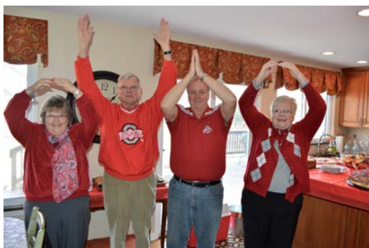
O H I O - 2 Vanderbrink Family members and 2 board members